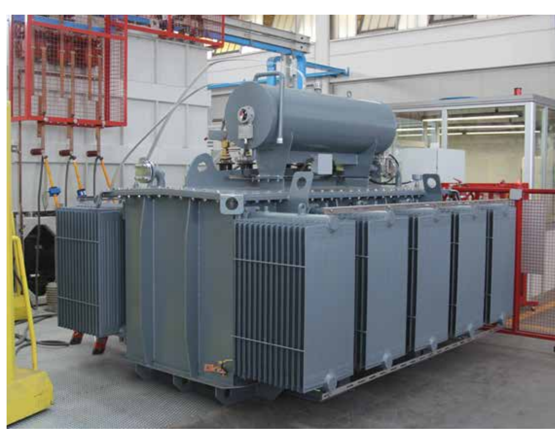
Oil-immersed short-circuit limiting reactor with shield, 4800 kVAR, 11kV

BE specialises in the development of class F and H dry type and cast resin reactors, oil-immersed magnetic core, in both medium and high voltage. GBE has recently produced several different air core three-phase short circuit limiting reactors with the active part completely fluid immersed. These reactors are made with three coils assembled on the same surface and secured to a base with non-magnetic profiles. The upper and lower parts are developed using magnetic metal screens to direct the flows produced by the windings. These oil-immersed reactors offer numerous advantages, including the possibility for installation outdoors or in environments characterised by high-level pollution, with minimal safety distances thanks to the grounded tank. These reactors are designed in such a way that the magnetic field is shielded and conveyed inside the tank itself, thus minimising the generation of external magnetic fields. These products are significantly smaller than dry type reactors and can be installed alongside other equipment and/or metal parts, thus optimising the use of space. Oil-immersed short-circuit current limiting reactors, unlike cast resin or VPI reactors, can thereforebeadaptedtosuitanytypeofinstallation and offer excellent performance, with a minimal