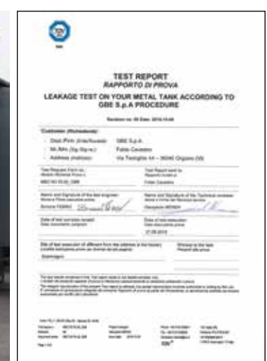
Test certificate issued by TÜV Laboratory Milan (Italy)

solution that meets their specifications, but above all a complete package. GBE currently offers seven types of bunds with two variants for the insertion of the transformer. The entire range of power is covered, from 100 kVA until 3150 kVA, however ad hoc solutions can also be developed for higher power levels.