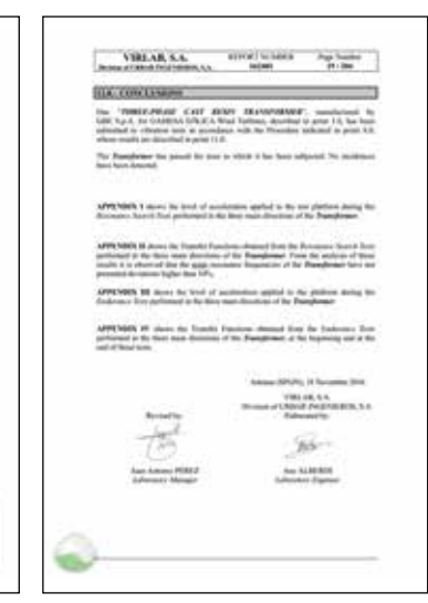
Vibration testing on cast resin transformer 2350 kVA ANAF, 33/0.69kV at Virlab Laboratory (Spain)

ast year GBE obtained GAMESA certification, making way for the supply of numerous cast resin transformers for wind power applications. The constructive design of the transformer for wind turbine generators varies depending on the type of installation, which may be: inside a transformer station at the base of the wind tower; inside the tower itself; in the nacelle in the presence of high power, as was the case for the GAMESA project. From a technical point of view, unlike solar plants, wind farms are able to guarantee greater power continuity. Wind transformers are also characterised by low core induction in order to adapt to high grid voltage fluctuations. Standard IEC 60076-1 states that a generator-powered machine must have an overvoltage withstand capacity of 14% for 5 seconds in the case of load rejection. This type of transformer must have suitable winding insulation. The machine can be coupled and decoupled multiple times to suit power demands. These events may lead to phenomena, which may compromise the working life of the machine in the long-term. In wind turbines, the transformer is normally positioned in small compartments. Dimensions and dissipation must therefore be optimised, also for operation in