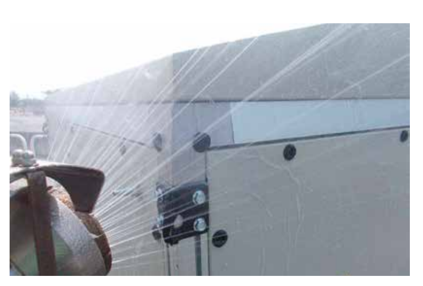
Seal testing at the TÜV Laboratory (Italy)

installation. In order to guarantee the IP23 protection class, the housing is subjected to two tests: the first to test the water seal with a normalised jet, sprayed at an inclination of 60°; the second to test the level of protection against solid foreign bodies with a diameter greater than 12.5 mm. Testing for the IP54 protection class on the other hand, is more complex. In this case, the housing must withstand the water seal test with jets sprayed from all directions, while protection against solid foreign bodies is tested in a test chamber, creating a vacuum inside the housing equal to 0.2 Bar. Both tests are considered passed if there is no water or dust inside the housing. In the case of cast resin transformers installed with IP54 protection, external heat exchange occurs by way of the housing's irradiating surface. For power levels greater than 630 kVA, this surface area must be enlarged, either by increasing the dimensions of the housing itself or modifying the selected panel type, opting for corrugated solutions.