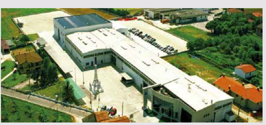
POWER AND CAST RESINTRANSFORMERS PLANT