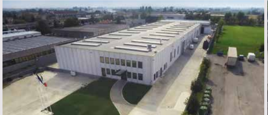
OIL FILLED TRANSFORMERS PLANT